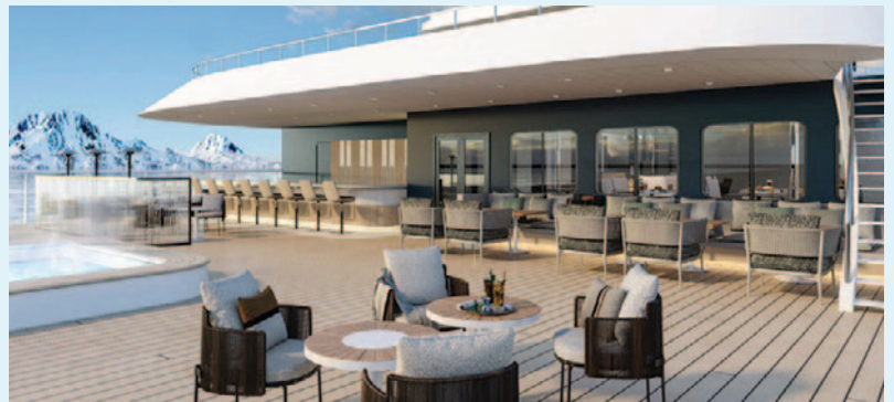
Café/Bar with swimming pool

Currently under construction in Finland, and scheduled to be delivered in October 2021, Swan Hellenic's Minerva is a new-generation expedition cruise ship. Although at 10,500 tons the ship is large enough to accommodate more than 250 passengers, Minerva will accommodate a maximum of 152 guests in 76 spacious staterooms and balcony suites. The low guest density results in one of the most generous indoor and outdoor space-to-guest ratios among cruise ships.